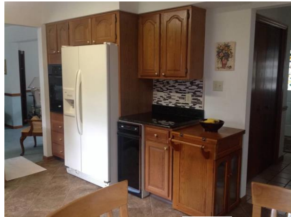
Kitchen featuring granite counters and an open floor plan. 12 x 16