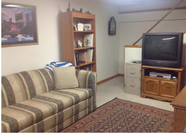
Partial finished basement